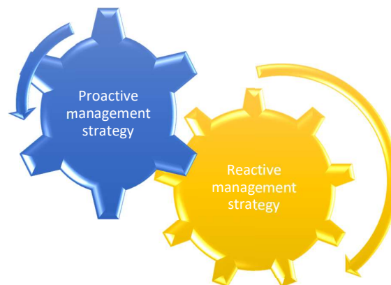
Fig3: Strategies to cope with supply chain risks (MS, 2004)

SCRM frameworks basically suggest two phases for risk management: • Risk mapping and modeling including risk identification, risk analysis, risk classification, and risk assessing and prioritizing. • Risk mitigation and contingency planning. The risk mitigation options depend very much on the category of risk and supply chain decision makers. Risk transfer, risk sharing, risk avoid and risk accept are the major decision making options. Many strategies have been described in the literature for evolving the coordination and collaboration mechanisms to mitigate the supply chain risks. Agility, flexibility and responsiveness are proposed as ideal generic strategies (Mohamed Bahroun, 2015).